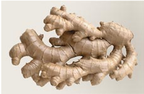
Ginger ( Zingiber officinale )

ginger has demonstrated anti-inflammatory properties, especially in arthritis, it has also been shown to block activation of brain cells that are involved in the inflammatory cascade implicated in the development of Alzheimer's.