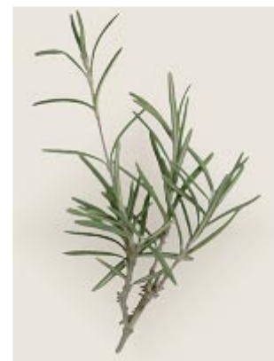
Rosemary ( Rosmarinus officinalis )

The next time you need relief from pain or inflammation, consider heading for the spice rack rather than the medicine cabinet. Some of nature’s most potent anti-inflammatories are found in ginger and rosemary. Ginger has been used for thousands of years as a remedy for the pain and inflammation of arthritis, 97 and research has confirmed its effects. 97-103 A recent study conducted at Johns Hopkins University examined ginger’s ability to suppress inflammatory compounds in cells obtained from the joints of arthritis patients, which had been cultured in the laboratory. “We discovered that the ginger extract blocks activation of pro-inflammatory mediators and its transcriptional regulator . . . [ginger extract] offers a complementary and alternative approach to modulate the inflammatory process involved in arthritis,” the researchers concluded. 101