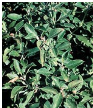
Ashwagandha ( Withania somnifera )