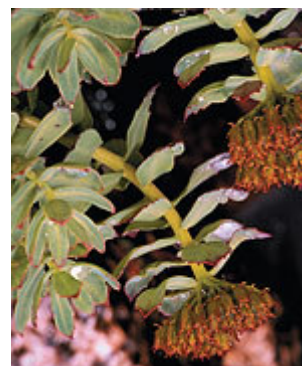
Rhodiola rosea seed heads

Multiple studies from the former Soviet Union have demonstrated Rhodiola's effectiveness in combating both physically and psychologically stressful conditions. One study in particular demonstrated Rhodiola's amazing ability to significantly reduce stress in a single dose. This study was unique in that it examined the effects of a single-dose application of adaptogens for use in situations that require a rapid response to tension or to a stressful situation. They found that Rhodiola was extremely effective in controlling stress generated by the part of the stress system known as the sympathoadrenal system. This is significant because, as the study points out, the traditional stimulant drugs used for controlling this stress have the potential to become addictive. Users often develop a tolerance, making it necessary for them to take larger and larger doses of the drug. This behavior can easily lead to unintentional drug abuse, have a negative effect on sleep structure, and cause rebound hypersomnolence or come-down effects. Not only does Rhodiola produce no negative side effects, but it also effectively increases both mental and physical performance.